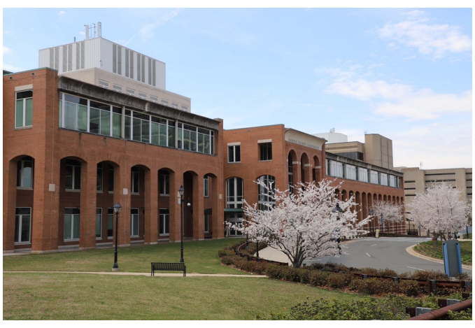
Sharon Bulova Center for Community Health

The momentum for Diversion First has not waned, and the County is committed to continually assessing for service gaps, quality improvement opportunities, and expanding programming based on data analysis and evolving community needs. Community crisis teams will expand in the coming months, and diversion efforts will align with the new nationwide 988 dialing code for crisis calls. The 988 code will provide a behavioral health alternative for 911/ calls for service in situations that do not require a public safety response, with trained call